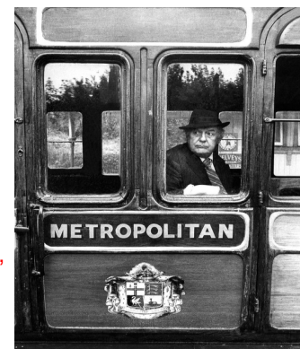
Poet Laureate absorbed in a track failure in the Neasden area

We will not accept ONE displacement over more than 30mins.