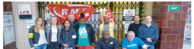
Picket lines at Oxford Circus (top) and Elephant and Castle (bottom)

Our strike on 8-9 July shut down the entire Tube network, but management isn't budging. That's why RMT, Aslef, TSSA, and Unite have called another strike for 5-6 August.